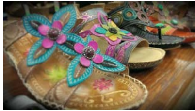
Colorful new classics from Spring Step

Find more details and additional events on the LaGrange County Visitor's Center website .