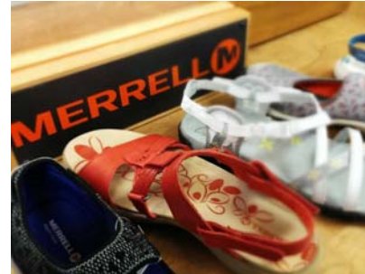
Style meets function with Merrell

A little bit of everything in sandals! From classy style from Rieker, bright and colorful from Spring Step, to durable walking sandals from Merrell, we have something for everyone!