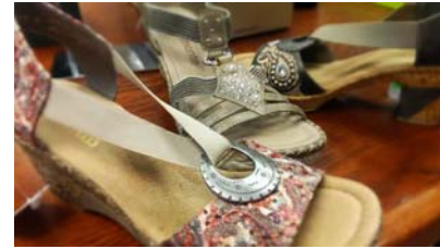
Beautiful styles from Rieker

A little bit of everything in sandals! From classy style from Rieker, bright and colorful from Spring Step, to durable walking sandals from Merrell, we have something for everyone!