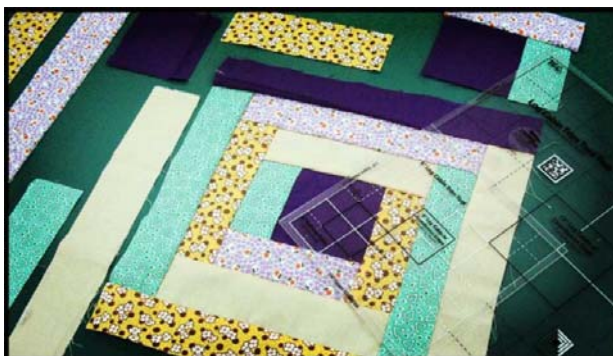
Log Cabin ruler shown here is available in 12" and 8"

The Log Cabin rulers can be found on our website here.