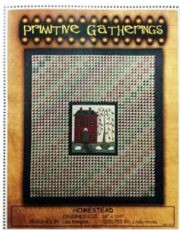
Homestead Primitive Gatherings

We know that quilters don't always have a lot of time, but you still want to quilt! We have been able to put a few more quilt kits on our website to help you out! Each quilt pictured here is also hanging in the store to give you extra inspiration!