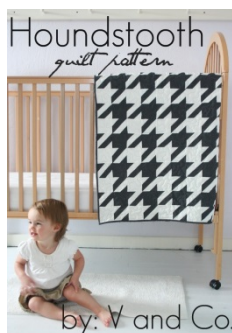
Houndstooth baby or picnic quilt