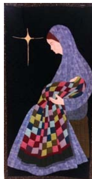
If Mary Had Been a Quilter